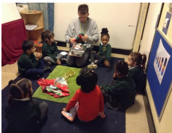
Figure 1 Small Group Time