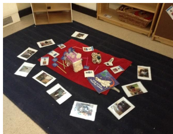
Small group set up for welcome time 1